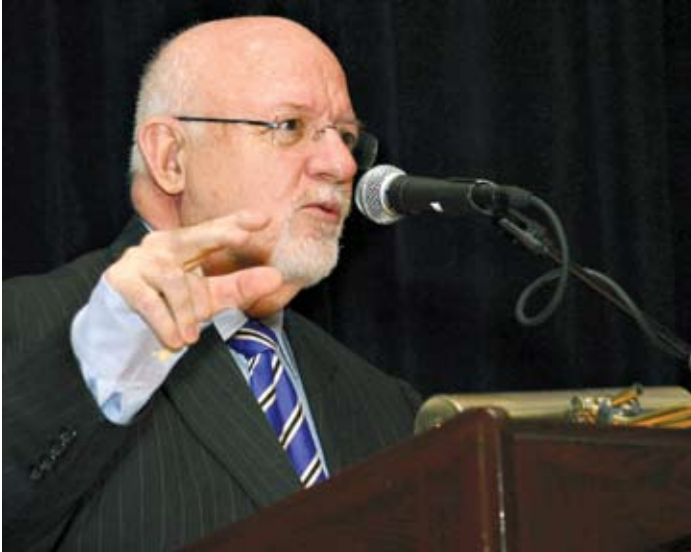
Ed Rollins, a senior presidential fellow at Hofstra University in New York and a senior political analyst for CNN, gives a rundown on the early days of the Obama presidency and national politics at the September 10 dinner gathering of the CalChamber Board of Directors.