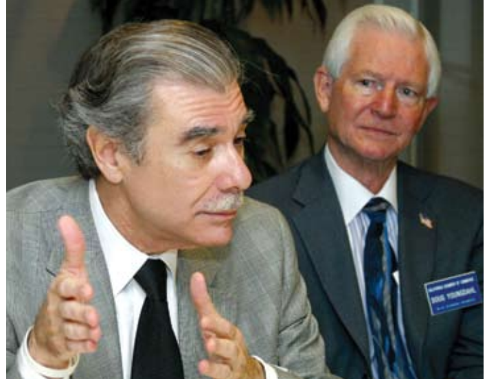
Providing a federal outlook on prospects for approval of free trade agreements at a CalChamber International Breakfast Forum on September 11 is Carlos M. Gutierrez, former secretary of commerce for President George W. Bush, former chairman and chief executive officer of the Kellogg Company, and now senior advisor to the U.S. Chamber of Commerce.