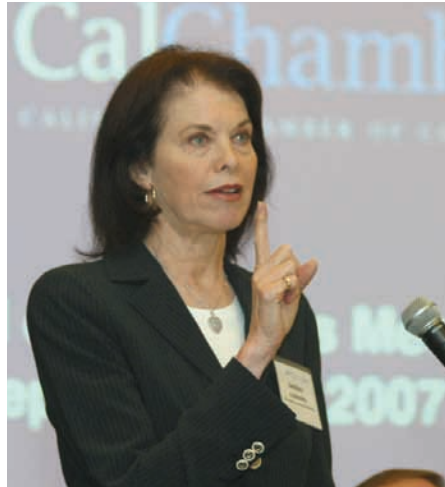
Sherry Lansing, chief executive officer of The Sherry Lansing Foundation, invites members of the California Chamber Board of Directors to support an effort to encourage retiring professionals to take on second careers to fill the urgent need for qualified math, science and career tech teachers in California schools. A number of CalChamber Board members and CalChamber member companies are among the early supporters of the EnCorps Teachers Program, which is supported by Governor Arnold Schwarzenegger. For more information, visit the program website at www.encorpsteachers.org .