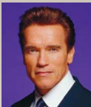
Governor Arnold Schwarzenegger