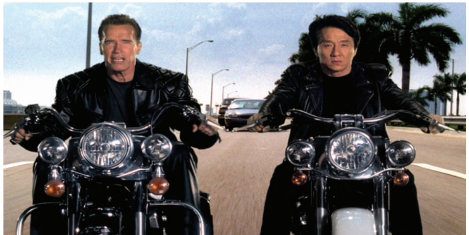
A public service announcement to discourage piracy features Governor Arnold Schwarzenegger and Hong Kong martial arts star Jackie Chan. The spot, produced by the California Jobs Commission and the Hong Kong Intellectual Property Department, began airing during the Governor's trade mission stop in Hong Kong and is scheduled to run for two months. The spot and more information are available at the commission's website, www.4cajobs.com .

wastewater treatment technology is helping conserve water and reduce pollution. Bao Steel is the largest steel plant in China and largest state-owned enterprise, employing more than 30,000 people. During a delegation trip to the Port of Shanghai, experts shared their ideas about how California can improve goods movement through its own ports.