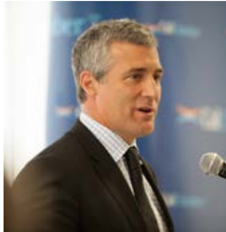
The Honorable Leon Grice