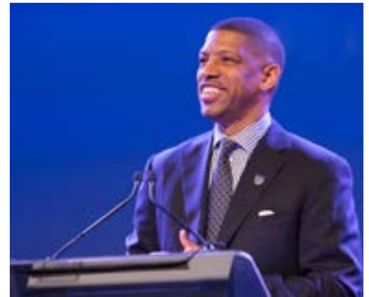
Mayor Kevin Johnson