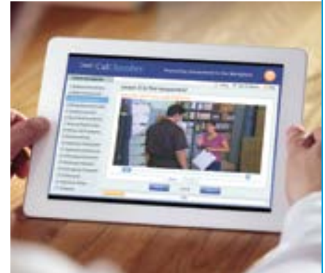
CalChamber's two-hour California Harassment Prevention Training course for supervisors meets state requirements. Tablet and Desktop Ready!

ORDER online at calchamber.com/coffeeperk or call (800) 331-8877. Use priority code AHSA.