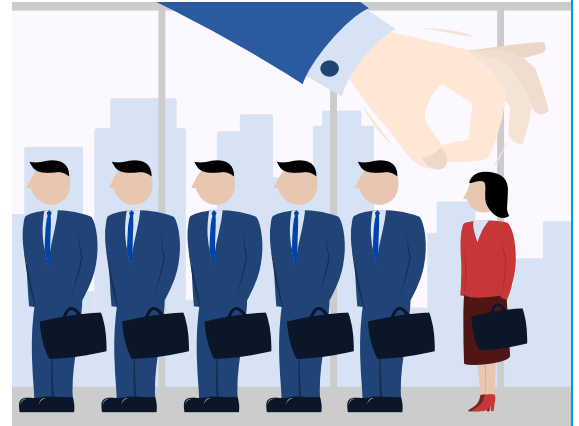
Mobile-Optimized for Viewing on Tablets and Smartphones

Cost: $199.00 | Preferred/Executive Members: $159.20