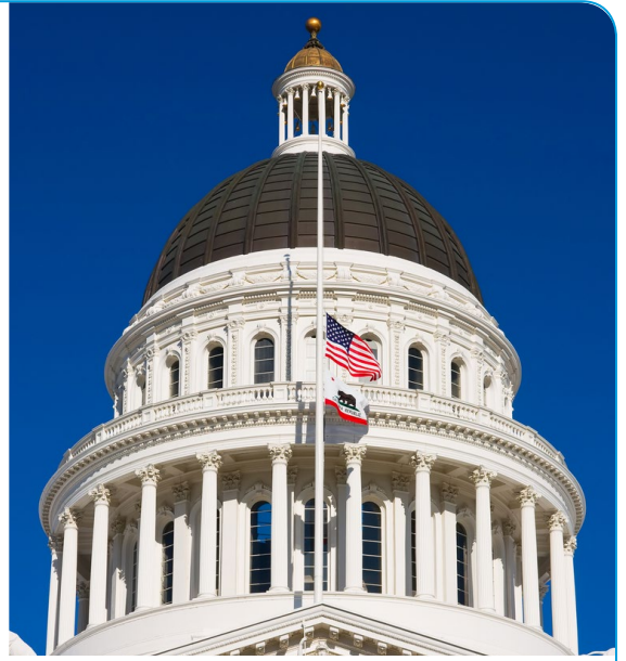
This webinar is mobile-optimized for viewing on tablets and smartphones.

Cost: $199.00 | Preferred/Executive Members: $159.20