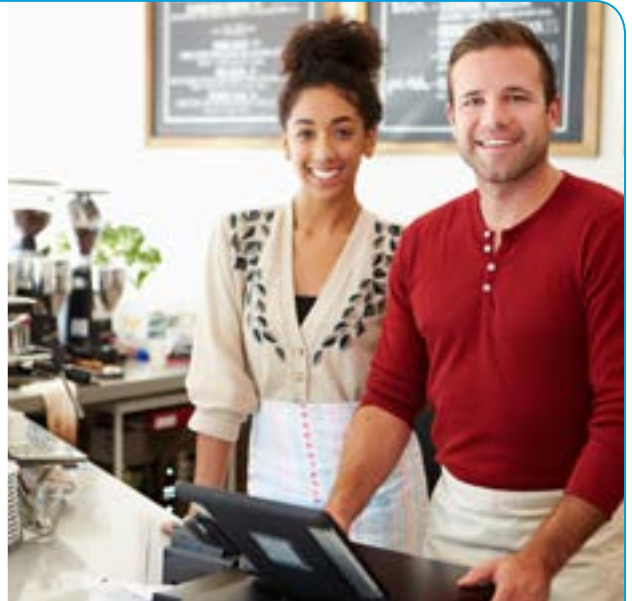
This webinar is mobile-optimized for viewing on tablets and smartphones.

Cost: $199.00 | Preferred/Executive Members: $159.20