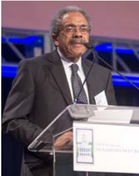
Presiding Justice Vance Raye of the Third District Court of Appeal urges listeners to get involved in programs that address problems affecting young people.