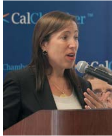
Ambassador Eleni Kounalakis