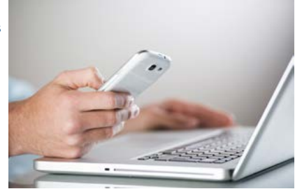
Preferred and Executive members receive their 20% discount. Approved for HRCI Credits

REGISTER at calchamber.com/july18 or call (800) 331-8877 and mention priority code REG.