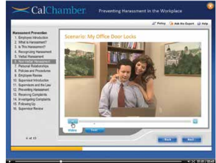
Online harassment prevention training in English or Spanish features videos covering realistic scenarios.