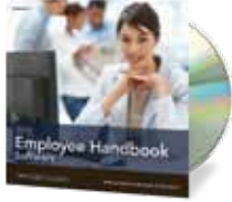
CD or download for Windows: $199

CalChamber's fully updated 2012 Employee Handbook Software makes it simple to customize and format workplace policies that comply with California and federal laws. Why hire someone else to create your handbook when you can do it faster and more affordably yourself?