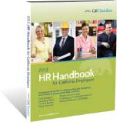
Step-by-step guide to managing HR issues and complying with labor laws: $39.99

CalChamber's 2012 HR Handbook for California Employers is an easy-to-understand guide for complying with complex California and federal employment laws. Make confident HR decisions about hiring, policies, benefits, compensation, workplace safety, termination and more.