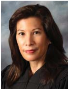
Chief Justice Tani G. Cantil-Sakauye

Severe budget cuts are hurting the ability of California courts to operate at the same time that more Californians are turning to the judicial system for help, state Chief Justice Tani G. Cantil-Sakauye told legislators this week.