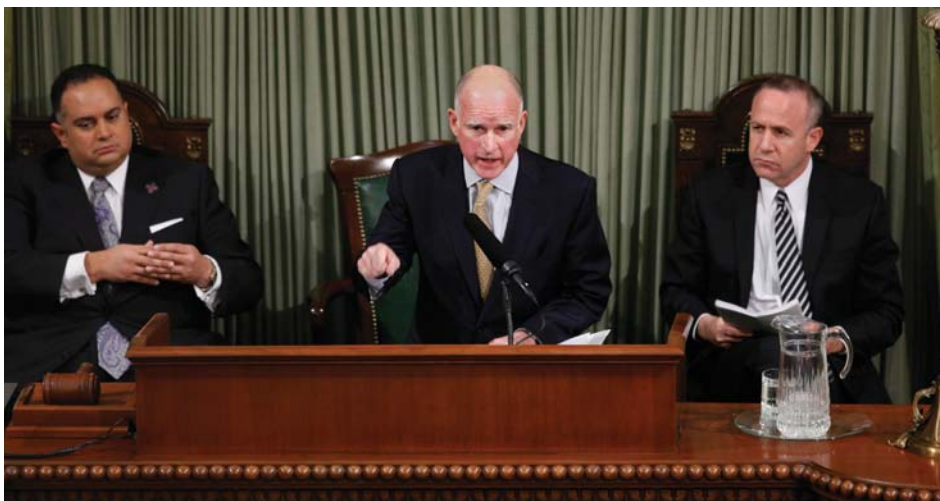
In his State of the State address, Governor Edmund G. Brown Jr. calls for cuts and temporary taxes to close the state budget deficit. At left is Assembly Speaker John A. Pérez; at right is Senate President Pro Tem Darrell Steinberg.