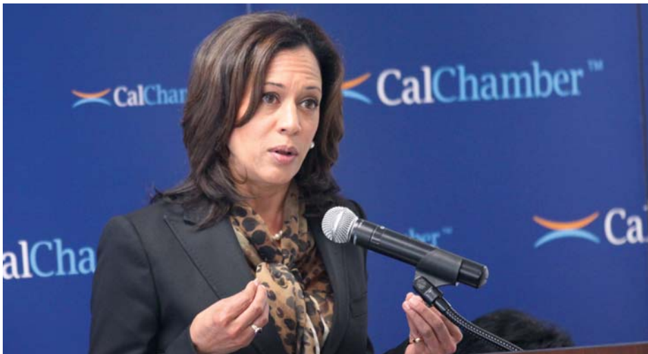
California Attorney General Kamala Harris shares with the CalChamber Board of Directors on June 2 an overview of her efforts to improve public safety, including dealing with transnational gangs, reducing the backlog of DNA testing requests and updating technology used by crime-fighting agencies.