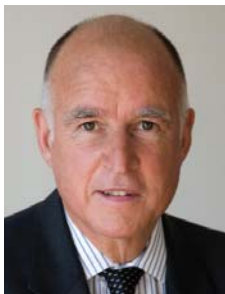
Governor Jerry Brown

In his State of the State address on January 31, Governor Jerry Brown again urged the Legislature to act on his budget proposal. He called for the two parties to work together to make the necessary budget cuts and send a