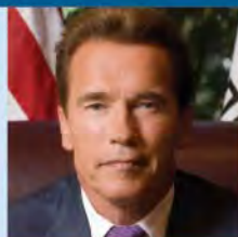
Governor Arnold Schwarzenegger