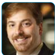
Chuck Todd NBC News Political Director Chief Washington Correspondent

Leading Our State and Nation Through Challenging Times