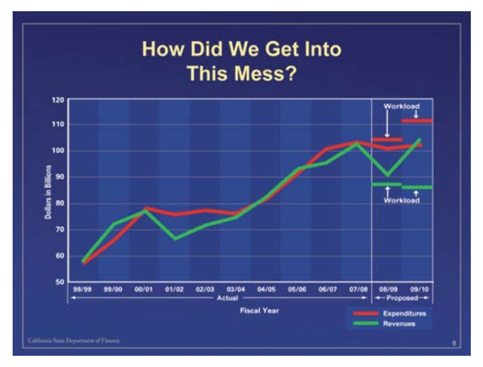
This state Department of Finance chart compares state revenues to expenditures. The "workload" amount refers to what state law/formulas require to be spent absent legislative action adjusting the spending.

solutions adopted by the Legislature fall short of the level proposed by the Governor, Genest said, it may be necessary for the state to make some payments with registered warrants, or IOUs. Genest did, however, assure listeners that despite these challenges, there is no reason to expect any delay in paying debt service or in repaying the $5 billion in short-term Revenue Anticipation Notes (RANs) sold in October 2008.