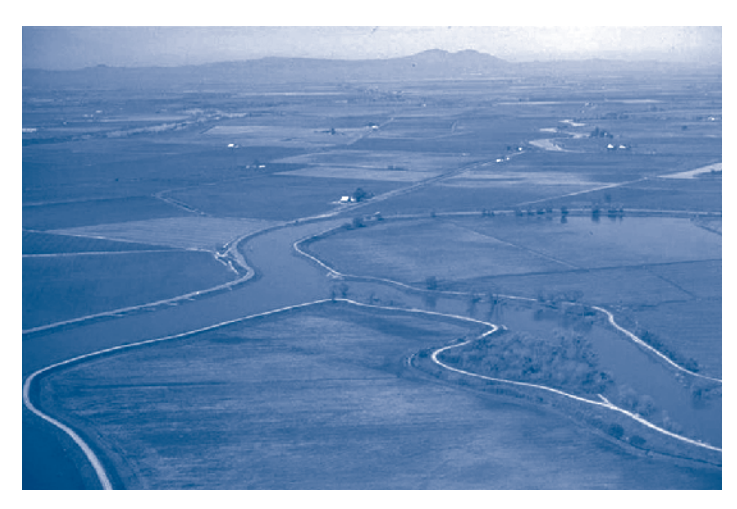
The Delta is the crux of the state's water delivery system.

The proposed canal is not a new idea. It originally was proposed in the 1980s, but was the subject of a referendum. More recently, academics have released reports that the peripheral canal must be considered if the Delta is to be preserved. Continuing drought conditions add a sense of urgency to the need to fix the Delta and yet provide sufficient water for people of the state.