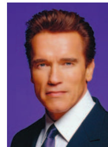
Governor Arnold Schwarzenegger