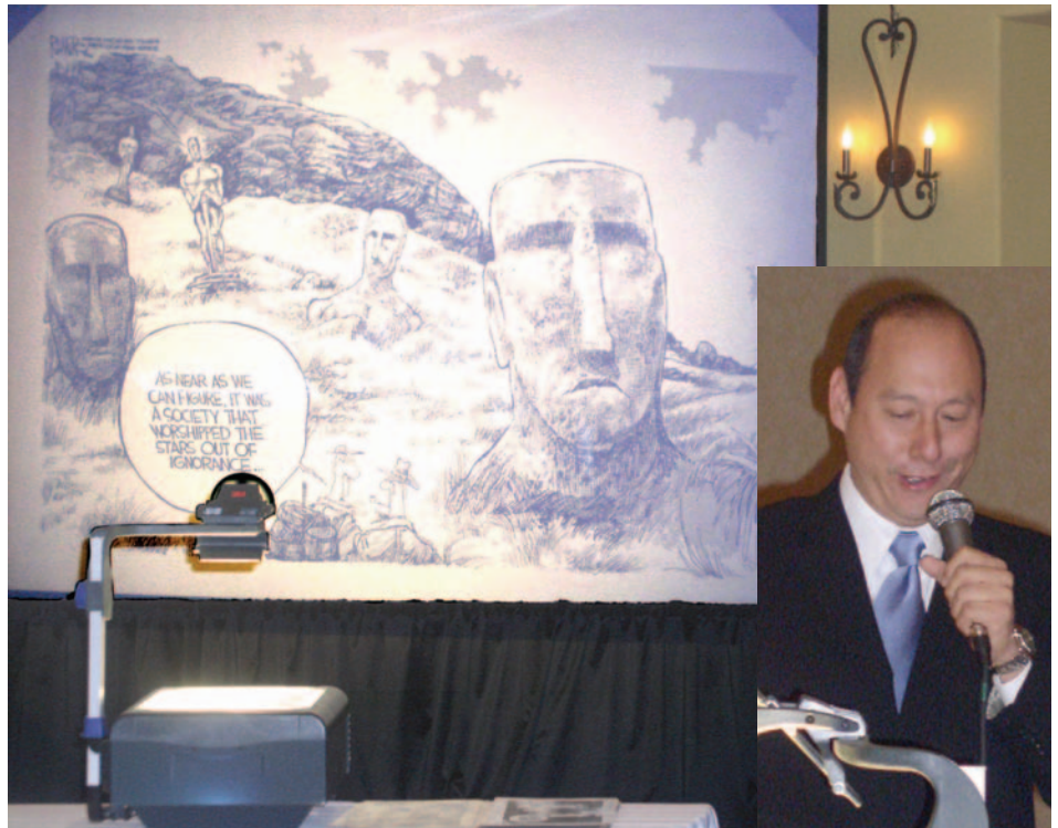
Michael Ramirez, editorial cartoonist with Investor's Business Daily and a featured speaker at the 2006 USA Roundtable, shows samples of his work to conference participants.