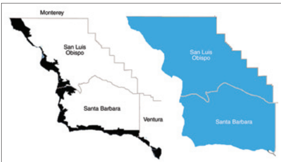
One example of a gerrymandered district: The area shaded in black at left is Congressional District 23 as redrawn by legislators after the 2000 census. At right, shaded in blue, is the same district redrawn by the retired judges after the 1990 census.