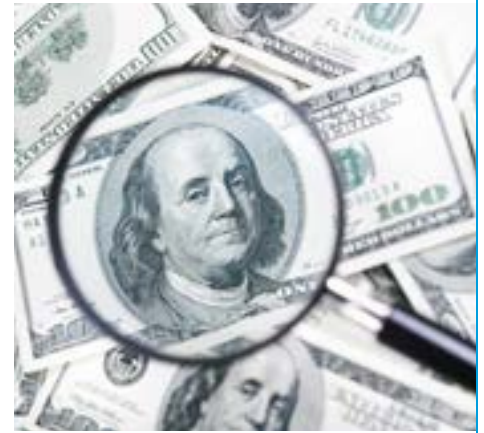
Mobile-Optimized for Viewing on Tablets and Smartphones

Cost: $199.00 | Preferred/Executive Members: $159.20