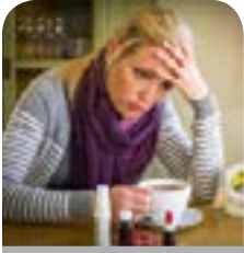
Paid Sick Leave

Employers in six California cities must consider paid sick leave requirements established by local ordinances in addition to the state paid sick leave law that marked its one-year anniversary on July 1.